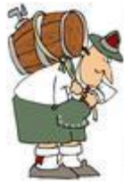
Single Person Carry