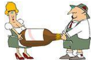
Two Person Carry