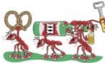
Picnic Pet Carry